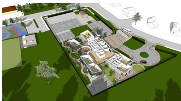
Site plan for new building

The Design Team are preparing for stage 2B of the design which will see the project go to tender. They have assured us that every effort will be made to ensure the project is kept on track and are hoping to have the new school building completed by the school year 2023/24 (all going to plan).