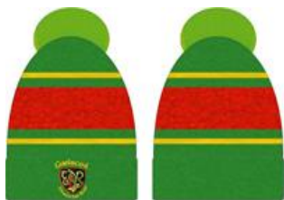
Bobble hat: €10