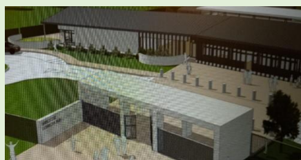
Front entrance of the new school

Tá an Fhoireann Dearaidh ag cur bailchríoch ar Thuarascáil Chéim 2B don Roinn Oideachais. Nuair a bheidh an tuarascáil seo ceadaithe agus costas an tionscadail curtha i gcrích beimid in ann tosú ag tógáil.