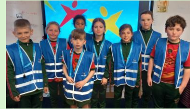
Coiste Bratach Gníomhaí/Active Schools'Flag Committeee (rang a 3)